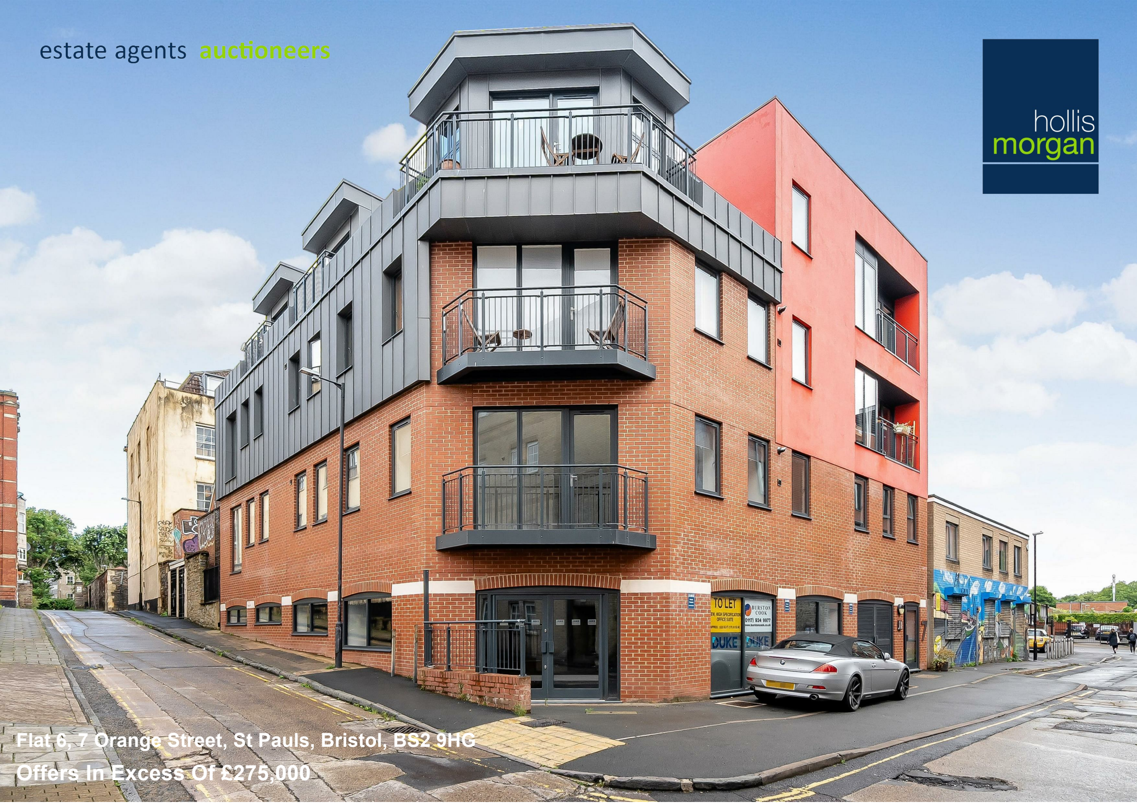
Flat 6, 7 Orange Street, St Pauls, Bristol, BS2 9HG Offers In Excess Of £275,000